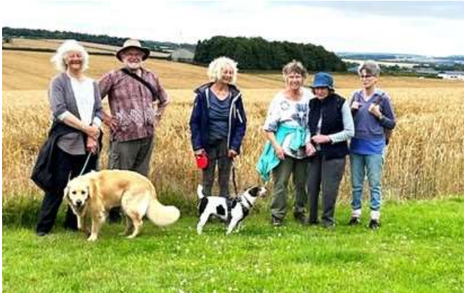
Looking south, Lo's Café is behind the white building on the extreme right side