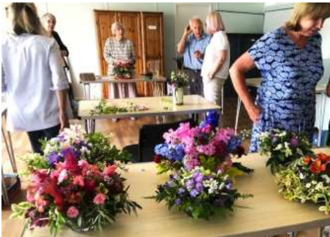
A very successful second flower arranging afternoon took place in the clubroom on Thursday,

27 th June. We looked at small, all-round arrangements. The group of ladies and one gentleman produced some very nice arrangements which would have graced any show bench and were worthy of some prize cards. Well done to all!