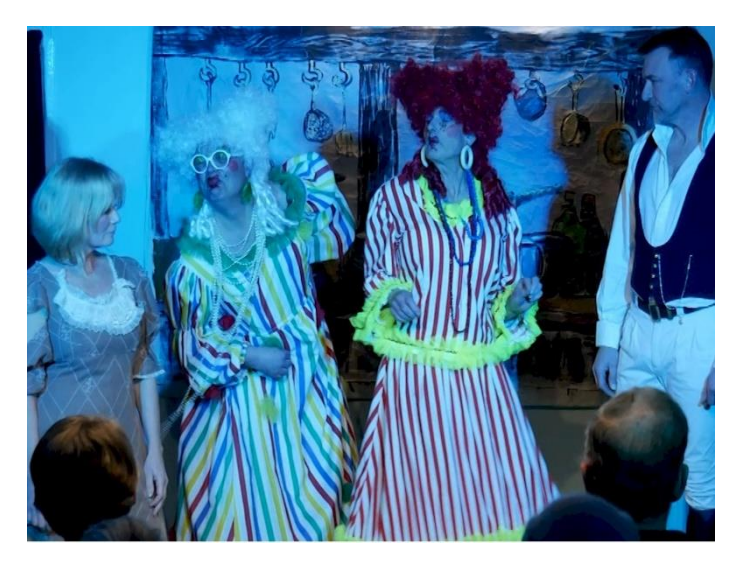
The Ugly Sisters, Scarlatina and Chlamydia having another go at poor Cindy while her beau, Buttons, looks on disapprovingly.