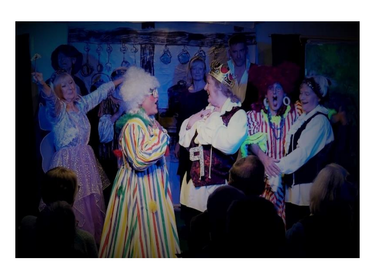
Who will get to marry the handsome Prince Charming?