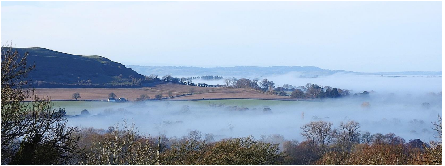
FROM IWERNE HILL TOWARDS CHILD OKEFORD