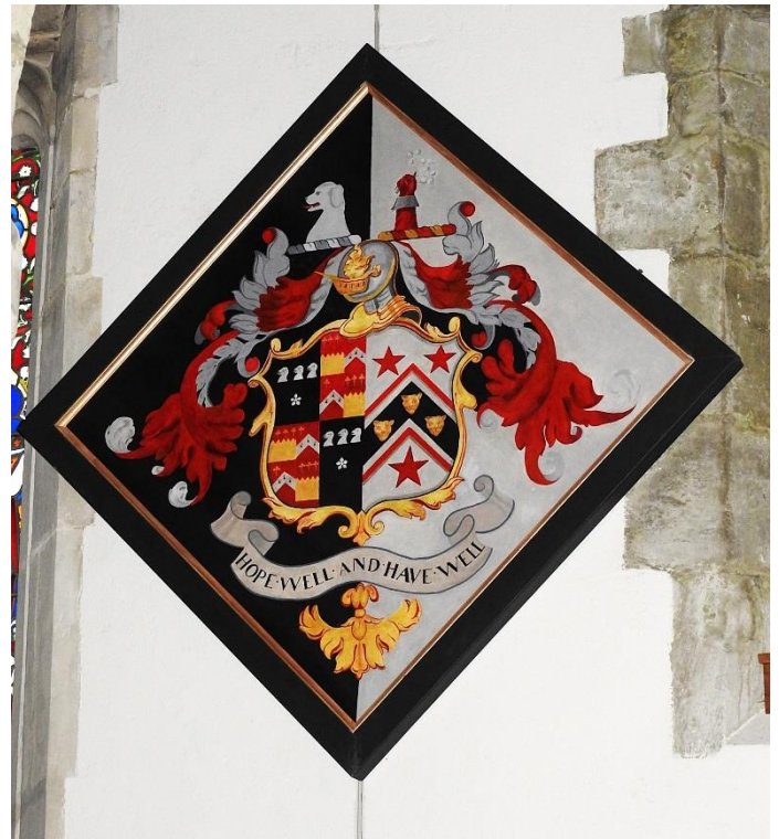
THE HATCHMENT IN ST MARY'S